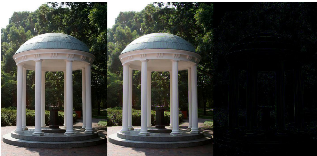
Original, demosaic, root squared difference.

This method produces artifacts. To visualize these artifacts compute the image of the squared differences between the original and reconstructed values for each pixel, summed over the three color channels.